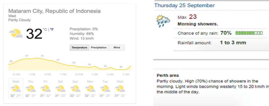
Figure 1. An example of the use of probability ideas in real-life.

With respect to real-life application, students could be introduced to information about the weather that predicts the likelihood of rain in a given day. Data could be gathered from the Internet as illustrated in Figure 1.