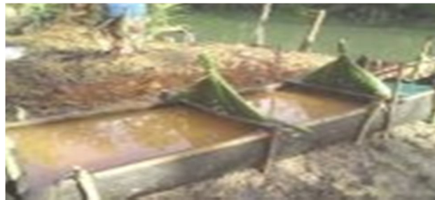
Place of Making Sago