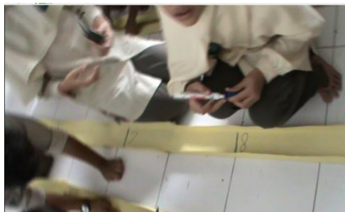
Figure 3. Ifah and friends made signs for the position of the car in every second

All of the students divided the distance by the time in every group. When they finished the calculation, teacher then asked them to put their car in the track as if the cars travel for one second. First, students measured the distance that they want using a measuring tape. After that, they put the car on it. Without request from the teacher Riska's group made a sign in the paper tape for the distance travelled by the car in one second.