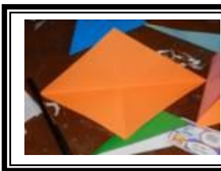
Figure 4: Result of students