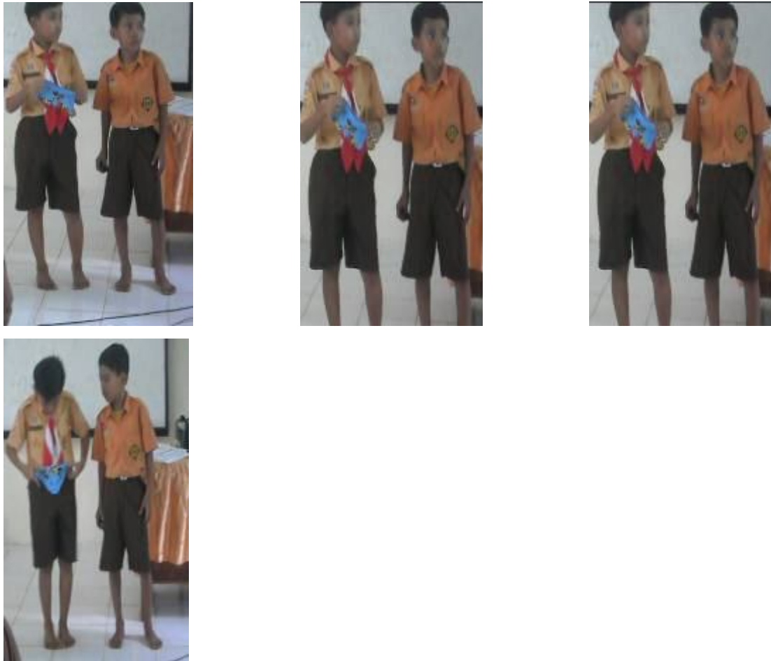
Figure 11: Presentation of student in front of class

The result shows that using traditional dance in mathematics classrooms can improve students' understanding on the concept of symmetry.