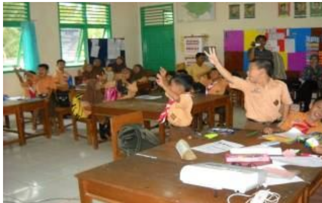
Figure 9: Discussion of students

Early activity introducing symmetry concept by showing both palm, later, then the teacher submits to students that if only we do not have palm which is symmetry, what a difficult life for us. Here the teacher have develops attitude of thankfulness to God, self esteem which is given by God little by little will be planted in student.