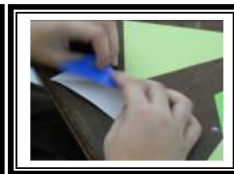
Figure 5: Strategies the students