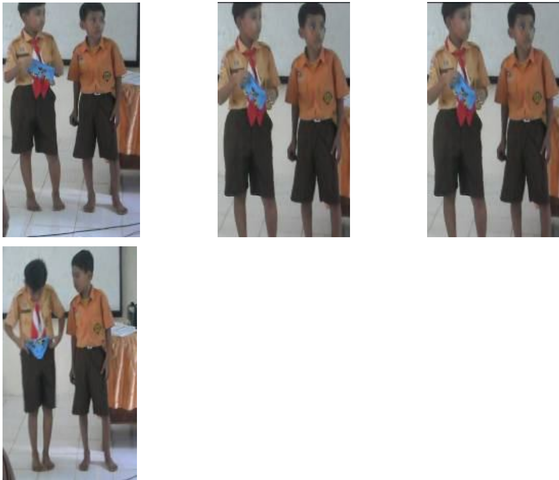
Figure 11: Presentation of student in front of class

The result shows that using traditional dance in mathematics classrooms can improve students' understanding on the concept of symmetry.