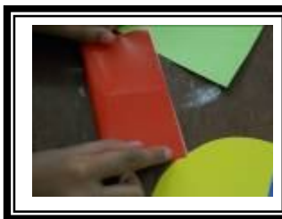
Figure 3: Folding the square