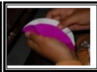
Figure 8. Folding the circle

In the paper folding activity, there were who made wrong answers, so the concepts of symmetry can be understood by students, teacher invited students to discuss in their group, and this discussion was guided by the teacher. Students wrote their answers on white board and then some groups were asked to be the next to present how many fold symmetry that each student obtained on flat shape, here we can see students were active, because it looked almost all students wanted to work, then the teacher wrote the correct answers from the students, students were not able to distinguish between