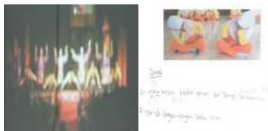
Figure. 2. Axis of symmetry

Later students realized that the folding line would be the axis of symmetry of clothes. Following this, students watched "badindin dance" video and worked on student's worksheet together in small groups. This worksheet contains problems to determine the axis of symmetry. In Figure 2, for example, students were asked to find any axis of symmetry.