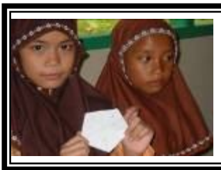
Figure 7. Students' explanations