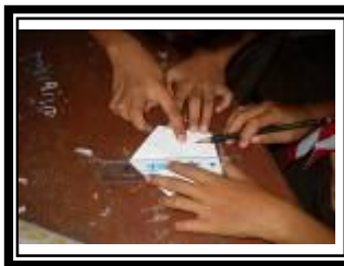
Figure 6: Folding the flat shape