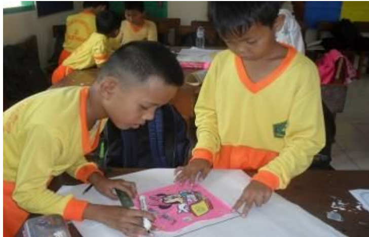
Figure 10: The activity of students

The students feel that this approach is relaxed and less formal. They can share their mathematical ideas. The smarter students can share their experiences to the group work discussion. In teaching activity, the teacher always starts the class with challenging problems which is in context or based on students' experience. This builds down-right behavior to student. Class discussions entangle some opinions from the students. This builds attitude of appreciating each other's opinion.